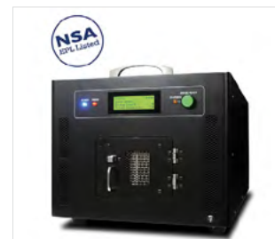
Kobra HDD can be supplied, on request, with the NSA National Security Agency approved Hard Disk degausser, model name MAGPRO 100.