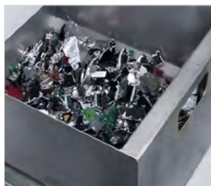
Easy removal and emptying of waste container.