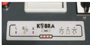
Convenient touch-screen panel with LED Feeding Control System.

The KOBRA HDD produces very low noise levels on a 24 hour continuous duty operation, destroying digital media devices with a shred dimension of 1" 9/16 x random.