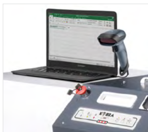
LOG MANAGEMENT SYSTEM: allows to scan and automatically store into a computer the barcode serial n. of the device being shredded keeping track of day and hour.