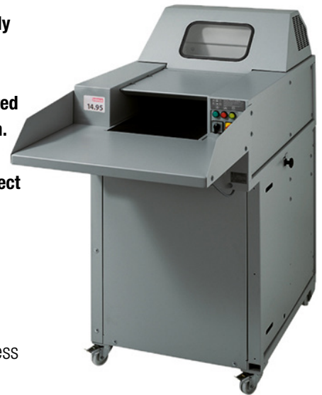
W/D/H 80/120 x 168 x 164 cm

The spacious feed table with integrated infeed conveyor belt provides controlled, effortless, safe and fast loading. The shredded material is collected in large-scale, mobile or swing-out containers under the cutting mechanism. The shred-press combinations are coupled to a baler for immediate fully automatic compaction of the cut material into compact bales. Reduction effect compared to the loose collection of the cuttings is about 70%.