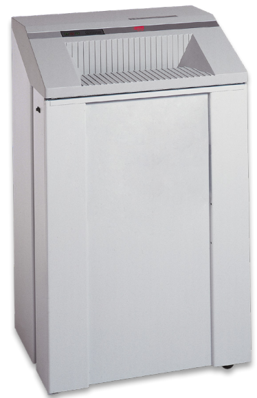
W/D/H 70 x 55 x 112 cm