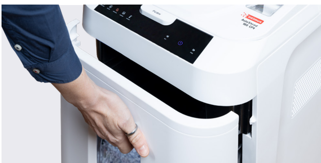
Large 32-litre collection bin.