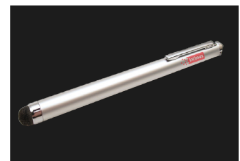
Stylus for comfortable operation of the touchscreen