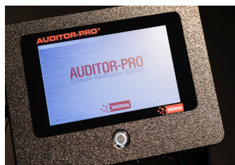
Creates erasure certificates – Touchscreen operation