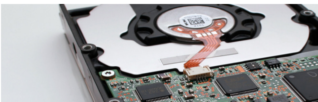
Secure and complete data erasure on hard disks