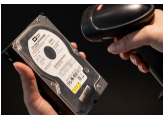
Scans serial numbers of hard disks before erasure