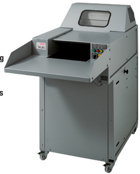
W/D/H 80/120 x 168 x 164 cm

The spacious feed table with integrated infeed conveyor belt provides controlled, effortless, safe and fast loading. The shredded material is collected in large-scale, mobile or swing-out containers under the cutting mechanism. The shred-press combinations are coupled to a baler for immediate fully automatic compaction of the cut material into compact bales. Reduction effect compared to the loose collection of the cuttings is about 70%.