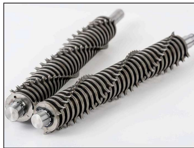
Aggressive cutting edges provide grip, and superior shredding performance.