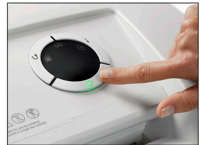
The command dial controls power up, reverse, and continuous run functions.