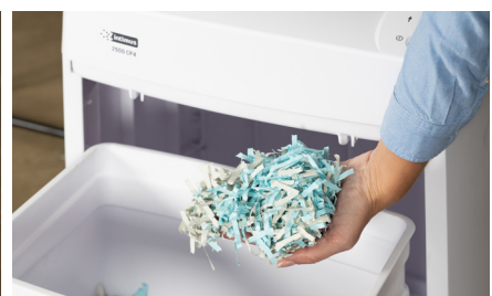
4,3x33 mm particles with security level P-4 according to DIN 66399 (ISO/IEC 21964).