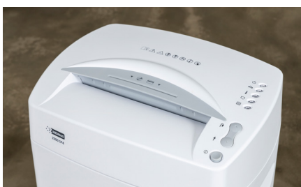
Intuitive operation thanks to clear push buttons and LED display.