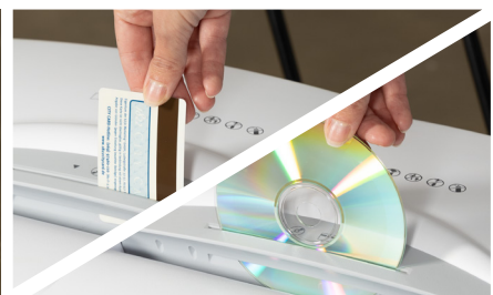
Credit cards and CDs can also be shredded via a separate feed slot.