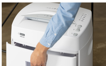
Removable 32-litre collection bin for easy disposal.